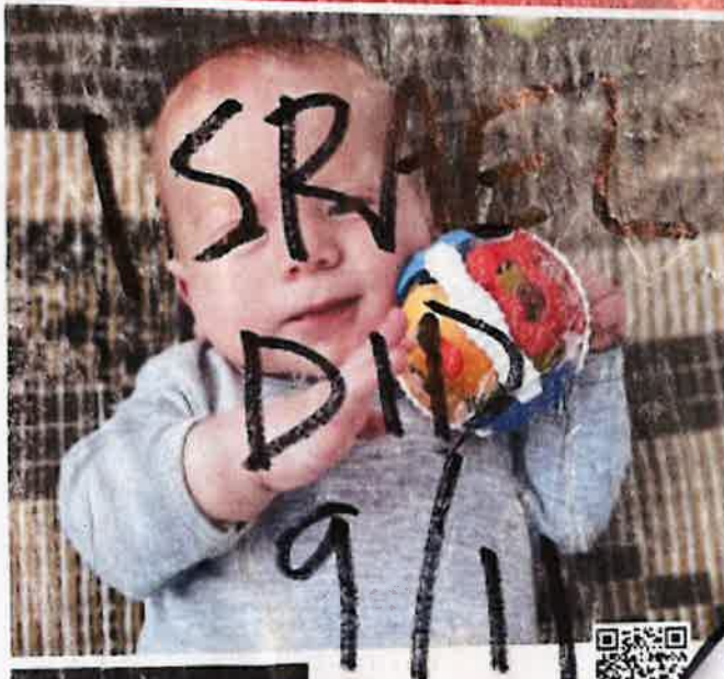
Kfir Bibas 10 months baby Israeli-Argentinian