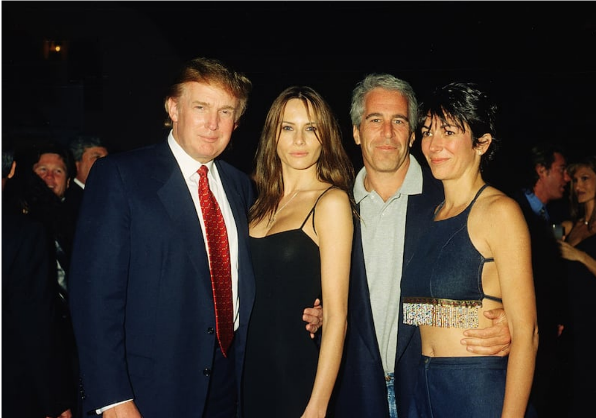
The long friendship between Trump and Epstein saw them party at Mar-a-Lago, including in February 2000 when they posed with their then-girlfriends, Melania Knauss and Ghislaine Maxwell. Melania became First Lady; Maxwell is serving 20 years in federal prison.

In 2022 Ghislaine Maxwell, Epstein's former girlfriend who procured him underage girls, would be sentenced to 20 years in federal prison for the sex trafficking of minors. Upon hearing of her arrest in 2020, Trump, then president, said he wished her well . "Her friend or boyfriend was either killed or committed suicide in jail. Yeah, I wish her well... Good luck."