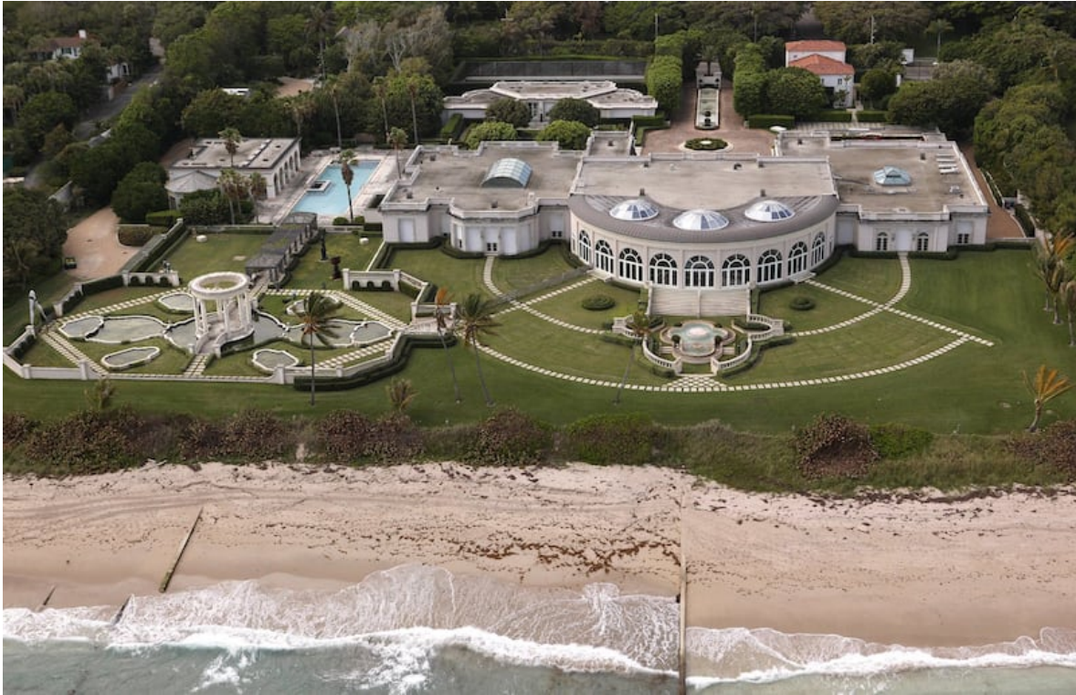
The two men fell out in 2004 over the purchase of the Maison de L'Amitié, an estate and mansion in Palm Beach which Trump bought from under Epstein.

He offers a portrait of Trump womanizing, yelling at staff and living a basically friendless life with only his daughter Ivanka, his secretary and his bodyguard truly loyal to him.