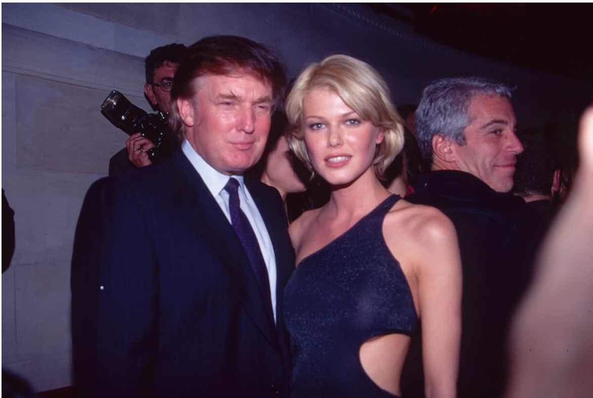
In April 1997, Trump and Epstein went to the Victoria's Secret Angels party together in Manhattan. Outside Trump posed with Belgian model Ingrid Seynhaeve.

The Epstein tape includes an allegation—which is impossible to verify—that Trump had an affair with a politician while in the White House. Epstein offered no proof or sourcing for the claim. He also alleged that Trump cheated on both his first wife Ivana and second wife Marla Maples with “a Black girl.” At one section, Epstein used a Yiddish racial slur to refer to Black women and alleged Trump boasted to him, “I’m f---ing all these Black women.”