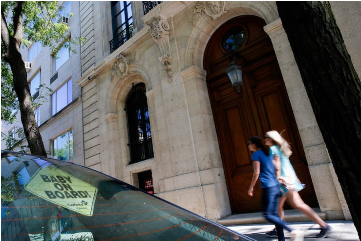
Wolff interviewed Epstein at his vast Manhattan townhouse on a day in August 2017. Just short of two years later it was raided by the FBI.

Trump's long friendship with Epstein, which spanned the late 1980s, 1990s and early 2000s has been well documented. In the 1990s, the two publicly partied at Mar-a-Lago and went to a Victoria's Secret Angels show together. In 2002, Trump told New York Magazine of Epstein, "I've known Jeff for 15 years. Terrific guy. He's a lot of fun to be with. It is even said that he likes beautiful women as much as I do, and many of them are on the younger side."